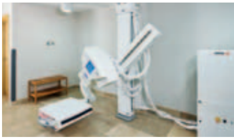
Fully motorized positioner