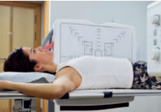
Ideal for ambulatory patients who can walk and talk