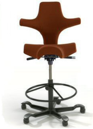
Item # CECS

After much research, Sound Ergonomics is pleased to offer an outstanding ergonomically designed chair from HÅG by Izzy. HÅG's unique philosophy that "The human body was not designed for sitting still but for variation and movement" is fundamental in the success of their design. Specifically designed for Allied Health use.*