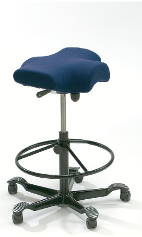
Item # CESS