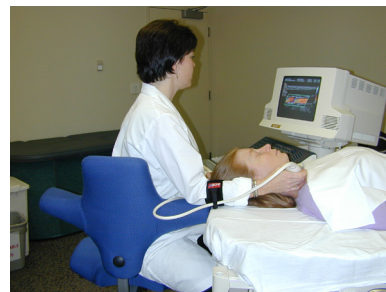
Sitting sideways on the Capisco chair offers support for the arm