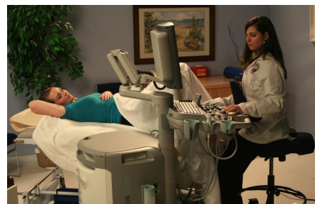
Optimize postural alignment for endovaginal scanning with trunk and forearm support.