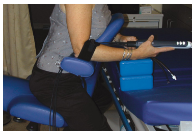
Lighten the load of heavy cables of mammotome and other cabled hand tools with a combination of the Capisco chair and support cushions.