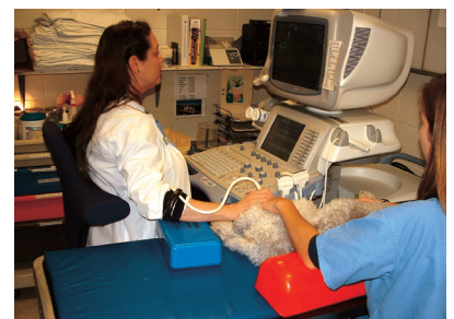
Capisco chair provides back support in this veterinary scan.