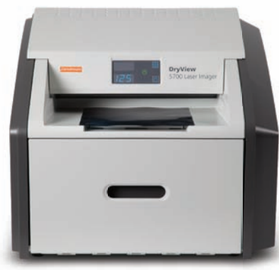
DRYVIEW 5700 Laser Imager Exceptional affordability, great simplicity.