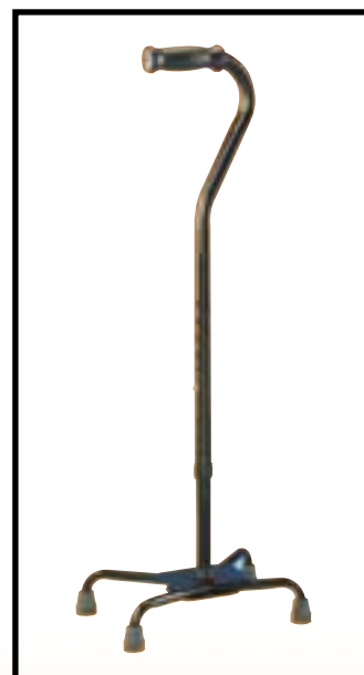
Large base quad cane model no. 7835-2