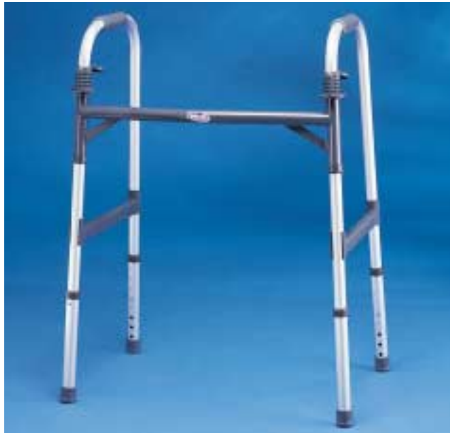
Model no. 6291-HDA

The Invacare Heavy-Duty Dual-Release Adult Paddle Walker is strong, stable and simple to use, helping individuals to walk with confidence and ease. This walker also is compatible with Invacare leg accessories.