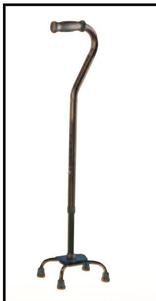
Small base quad cane model no. 7831-2