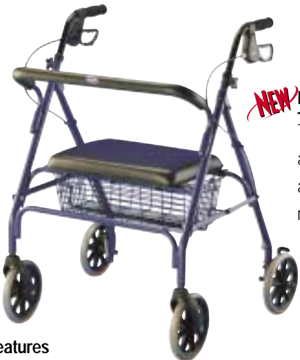
NEW Model no. 66500

The Invacare Heavy-Duty Dual-Release Adult Paddle Walker is strong, stable and simple to use, helping individuals to walk with confidence and ease. This walker also is compatible with Invacare leg accessories.