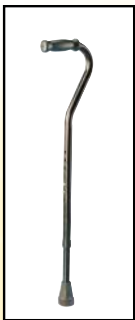
Offset base quad cane model no. 8940-6