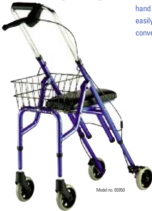
Model no. 65950

Introducing the new Invacare® Knee Walker. The Knee Walker is a great alternative for those who are weary of the discomfort related to crutches. It features a comfortable knee pad for resting the wounded limb, and it is easily maneuverable with its five-inch front swivel wheels. Its easy-to-operate ergonomic hand brakes keep the consumer in control. In addition, the Knee Walker folds easily for storage or transport, and it comes with a basket for the consumer's convenience.