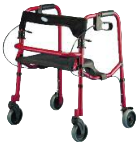
Color: Electric Red Model nos. 65100R Rollite Adult, 65100R-JR Rollite Junior (shown)

The Invacare line of Rollite® Rollators is unlike any other rollator line in the industry. Invacare has taken the Rollite one step further, offering the sizes, wheel types, and colors that consumers want. The Rollite line offers adult and junior sizes in different colors. For improved mobility over rougher terrain, large 8" wheel models are available in adult and tall sizes (Midnight Blue color). Along with additional features, the Rollite line provides the comfort, durability and quality that consumers have come to expect from Invacare products.