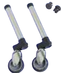
3" Swivel Wheel Attachments with Rear Glide Tips