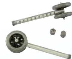
Bariatric Wheel Kit

Model no. 6372 only to be used with Invacare bariatric walker 6441-A