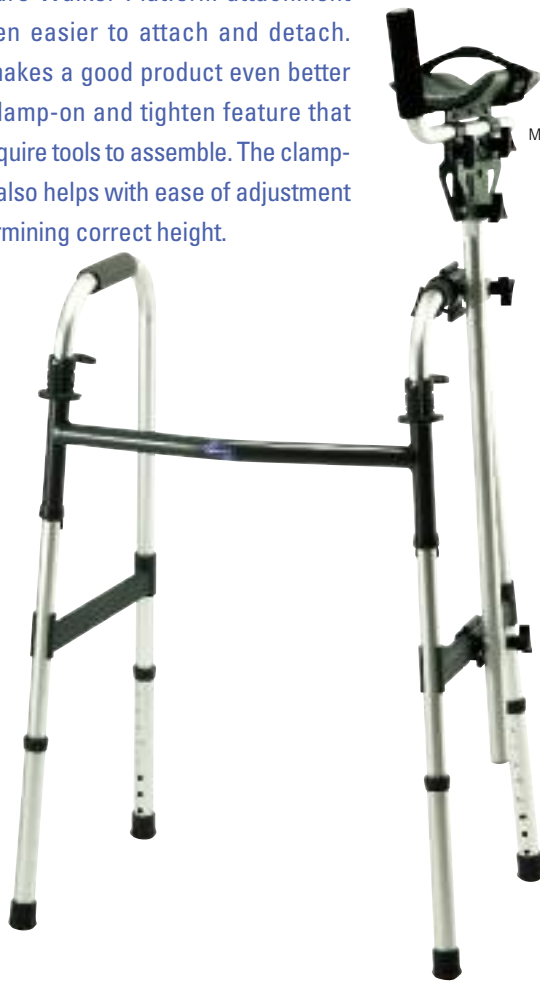
Model no. 6027

The Invacare Walker Platform attachment is now even easier to attach and detach. Invacare makes a good product even better with a 2" clamp-on and tighten feature that does not require tools to assemble. The clamp-on feature also helps with ease of adjustment when determining correct height.