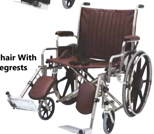
Chair With Legrests

See page 5 for wheelchair parts and accessories