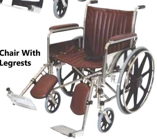
Chair With Legrests

See page 5 for wheelchair parts and accessories