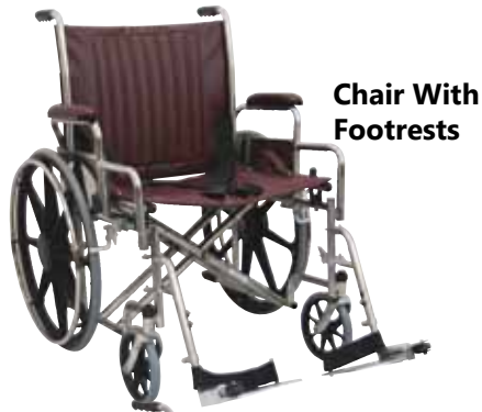
Chair With Footrests