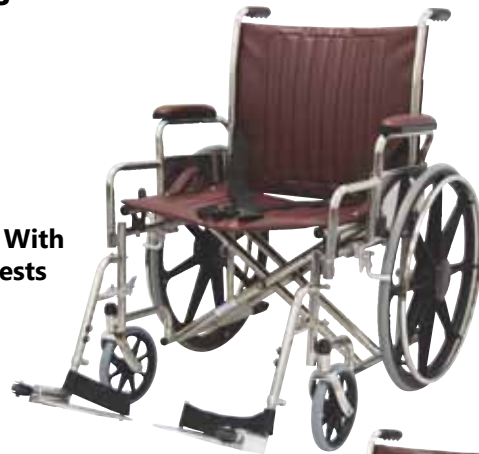
Chair With Footrests