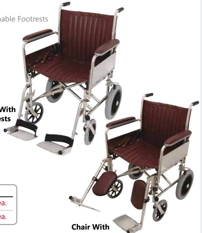
Chair With Legrests