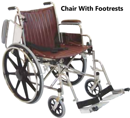
Chair With Footrests

See page 5 for wheelchair parts and accessories