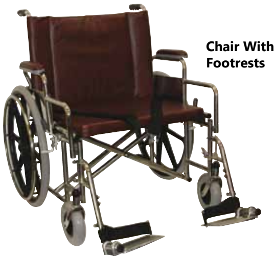
Chair With Footrests

See page 5 for wheelchair parts and accessories