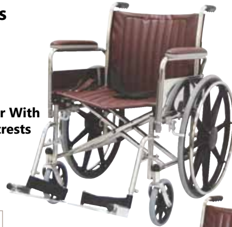
Chair With Footrests