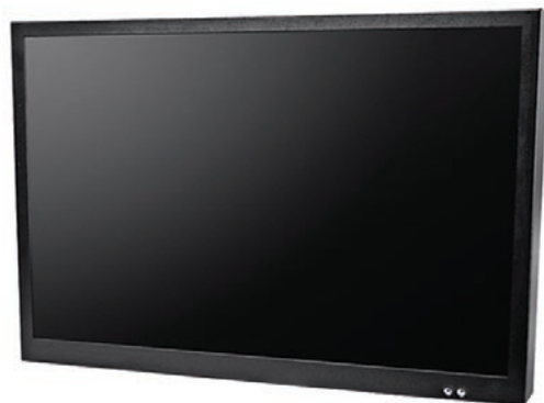
Optional large display monitor*

Simply put, MediPort can be incorporated easily into virtually any layout, any workflow, for any need.