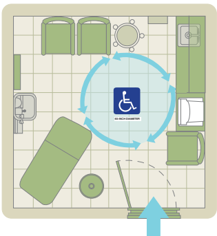
The Americans with Disabilities Act recommends a 60" wheelchair turning space