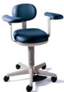
Midmark 427 Air Lift Physician Stool

Midmark is more than just a manufacturer of healthcare products. We are a provider of innovative solutions that work for you.