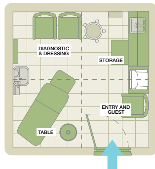
The four zones of the standard primary care exam room