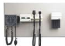
Midmark 663 Instrument Panel

The foot-operated Midmark 427 stool adjusts to fit the physician's specifications. Its contoured seat is ergonomically designed for comfort while optional armrests and backrests are also available for added support.