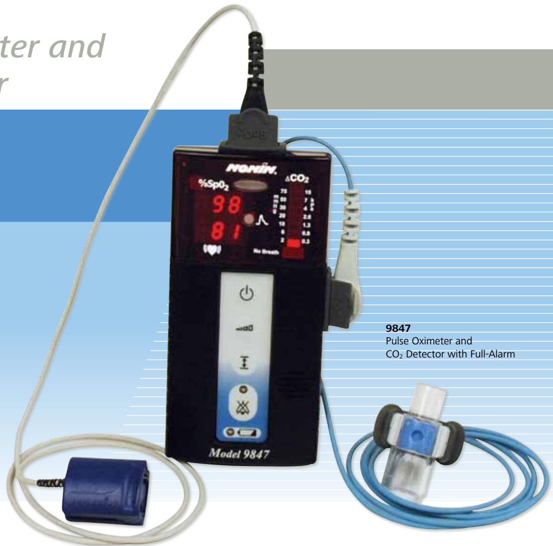
9847 Pulse Oximeter and CO 2 Detector with Full-Alarm