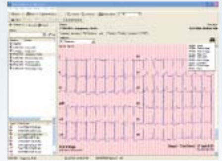
Program your own views for reviewing the test after completion.