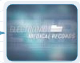
Connects to Electronic Medical Records Systems

The Welch Allyn Exercise Stress ECG System downloads information to the Welch Allyn CardioPerfect™ Workstation Software, which provides paperless efficiency as well as connectivity to many leading EMR systems. This software puts patient records from a variety of Welch Allyn diagnostic instruments at your fingertips, giving you the ability to store, access, review, compare and edit diagnostic test data from any computer on your network.