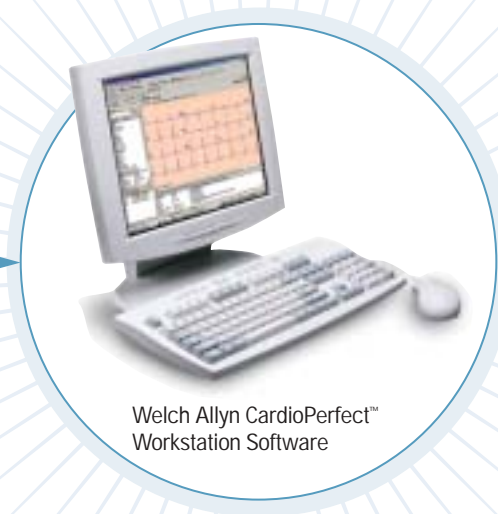
Welch Allyn CardioPerfect™ Workstation Software