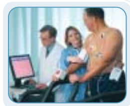
Welch Allyn PC-Based Stress ECGs