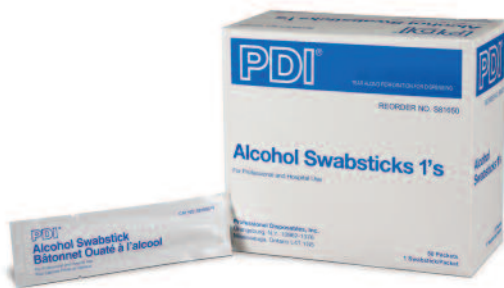
E. Alcohol Swabstick 1's