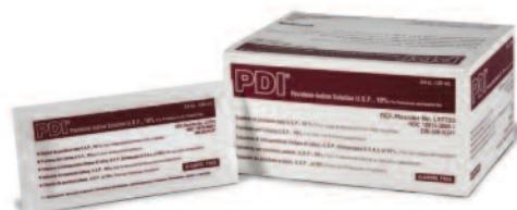
P. PVP Iodine Solution