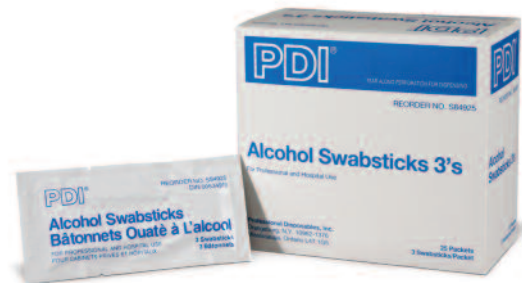
F. Alcohol Swabstick 3's