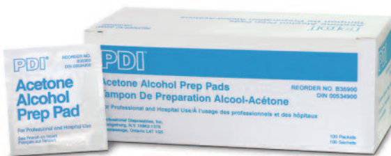
G. Acetone Alcohol Prep Pads – Medium