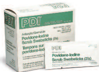
O. PVP Iodine Scrub Swabsticks 3's