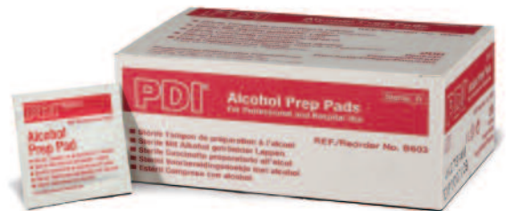
B. Alcohol Prep Pads – Sterile Medium