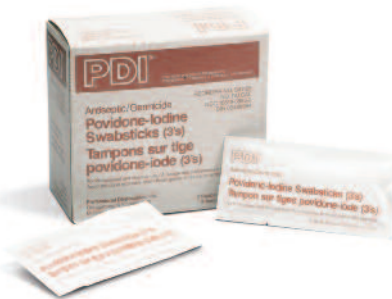
M. PVP Iodine Prep Swabsticks 3's