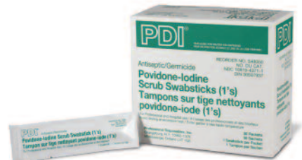
N. PVP Iodine Scrub Swabsticks 1's