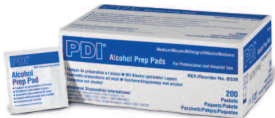
A. Alcohol Prep Pads – Medium