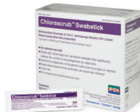
B. Chlorascrub™ Swabstick for pre-operative and pre-injection skin preparation