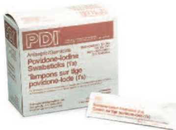
L. PVP Iodine Prep Swabsticks 1's