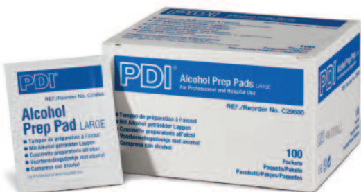
C. Alcohol Prep Pads – Large