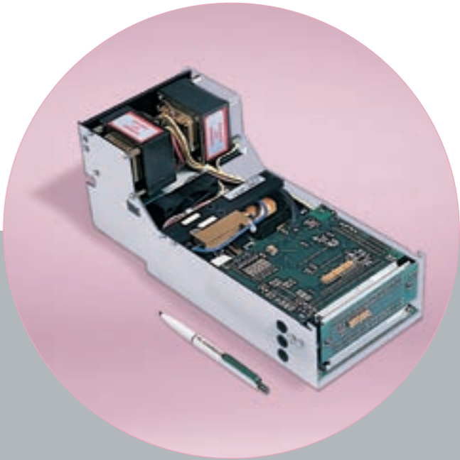
Image quality is never compromised with its full-featured technology and excellent performance. The ripple-free output improves contrast, shortens exposure times, reduces glandular dose, eliminates retakes and extends the life span of the x-ray tube.

Apart from being truly mobile, the Planmed Sophie Classic Mobile stands out from other mammography units with its integrated and extremely compact high-frequency generator. The dual power generator has established a considerable degree of technical superiority with imaging power that is truly constant and efficient.