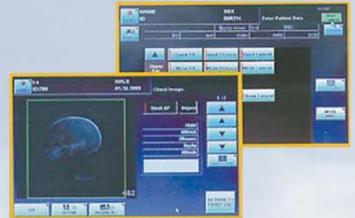
GENERATOR INTEGRATION, DR