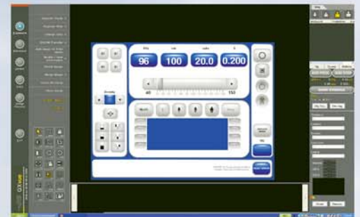
GENERATOR INTEGRATION, CCD