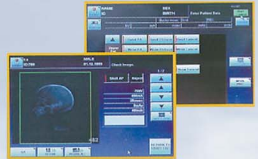
GENERATOR INTEGRATION, DR