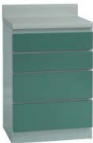
6004 24" Base Cabinet with four drawers