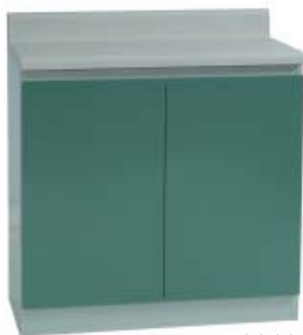
6010 36" Base Cabinet with two doors and two adjustable shelves