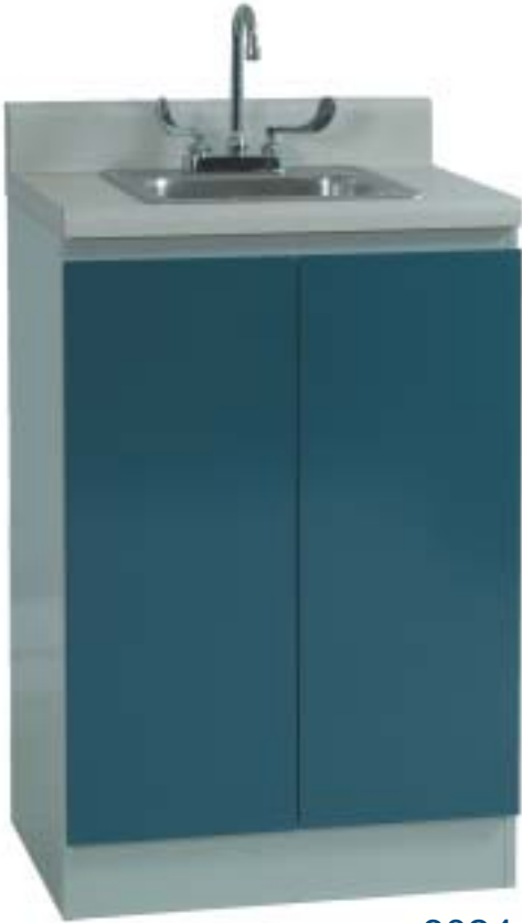
6024 24" Base Cabinet with sink

You can easily add one or more sinks to any room. UMF base cabinets with sinks come in the most useful sizes and configurations. Sinks are available in 24, 30 or 36-inch base cabinets or our popular 30 x 30-inch corner cabinet. All come standard with a stainless steel sink, stopper basket and chrome plated gooseneck faucet with wrist blade handles.