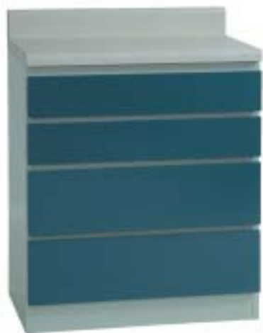
6002 30" Base Cabinet with four drawers

Our base cabinets are 36 inches high with 19 inch deep countertops that have a 4 inch high backsplash. One-piece continuous countertops can be fabricated up to 12 feet in length. All cabinetry can be fitted with optional locks. Changing drawer and door fronts is quick and easy on UMF modular cabinets ~ a feature available only from UMF.