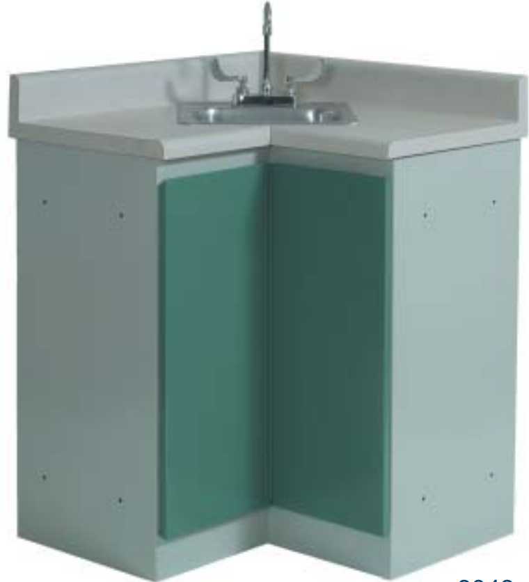
6048 Corner Base Cabinet with sink