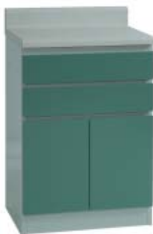
6014 24" Base Cabinet with two drawers and two doors