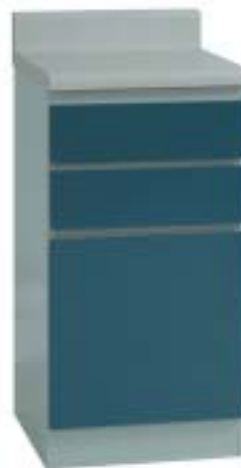
6017 18" Base Cabinet with two drawers and one door

6012 30" Base Cabinet with two drawers and two doors is also available