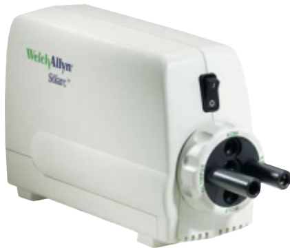
49500TW Solarc MFI Light Source with Turret