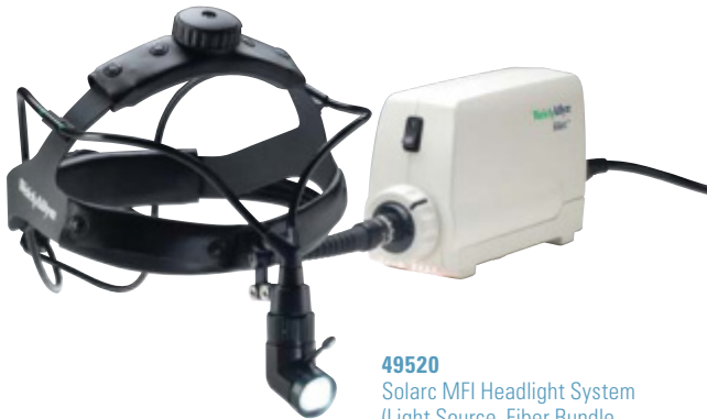
49520 Solarc MFI Headlight System (Light Source, Fiber Bundle, Headband/Luminaire)