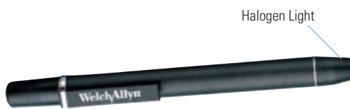
76600 Halogen Professional PenLite