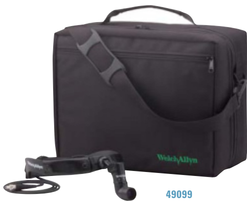
49099 Carrying Case