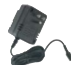
74180 Charger Only for Portable Power Source