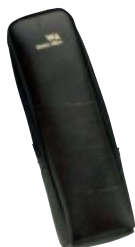
05232-U Soft Carrying Case