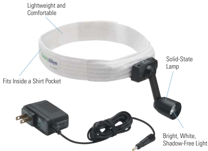
46070 Solid-State Portable Headlight with Direct Power Supply/Charger