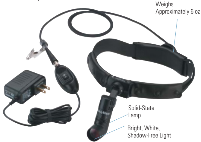
49020 Solid-State Procedure Headlight with Direct Power Supply

Operate the Headlight from a Belt-Clip or Direct Power Source