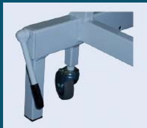
Unique wheel raising system allows for easy positioning and storage.