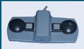
Electric foot switch.

The Multi-Flex Physical Therapy Table is specifically designed for manual therapy. The durable steel frame construction separates our tables from the competition.