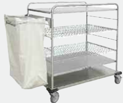
#7920 shown with optional 120113 trash bag kit