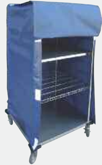
#7930 shown with optional 29655 cart cover