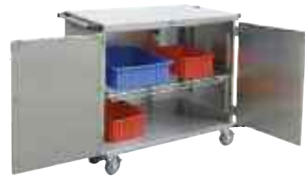
Model 6935 with both doors open