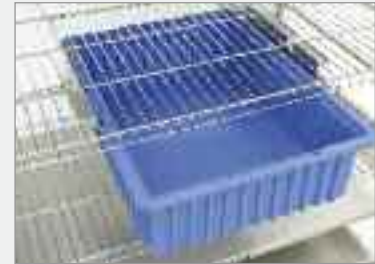
#120120 blue bin