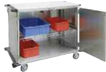
Model 6935 shown with one door secured in open position with hold open latch