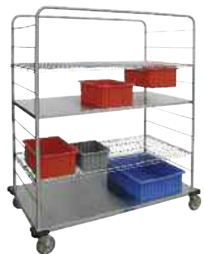
#7940 shown with optional bins (120119 red, 120118 gray, 120120 blue)