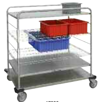
#7920 shown with optional bins (120118 gray, 120119 red, 120120 blue)