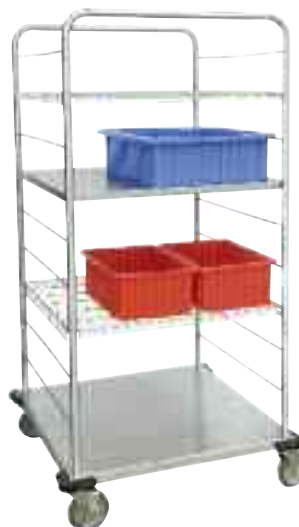
#7930 shown with optional bins (120120 blue, 120119 red)