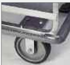
Optional Perimeter Bumpers provide protection for walls and furnishings