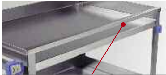
Front rails on all three shelves prevent items from falling during transport.

Guard rail carts eliminate spills and breakage when transporting items that could easily tumble off shelves.