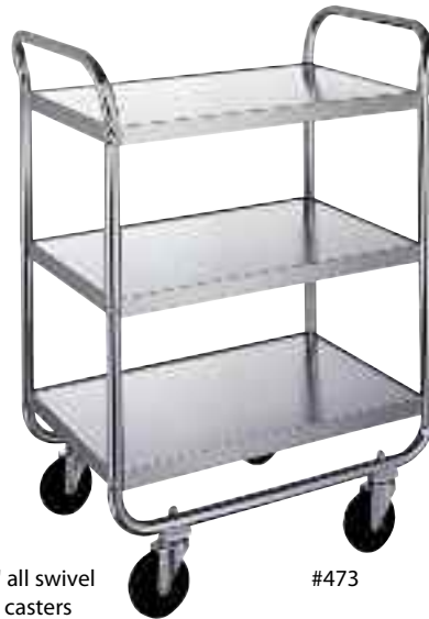
4" all swivel casters

Economical chrome ships knocked down (KD) which is Fedex or UPS ground