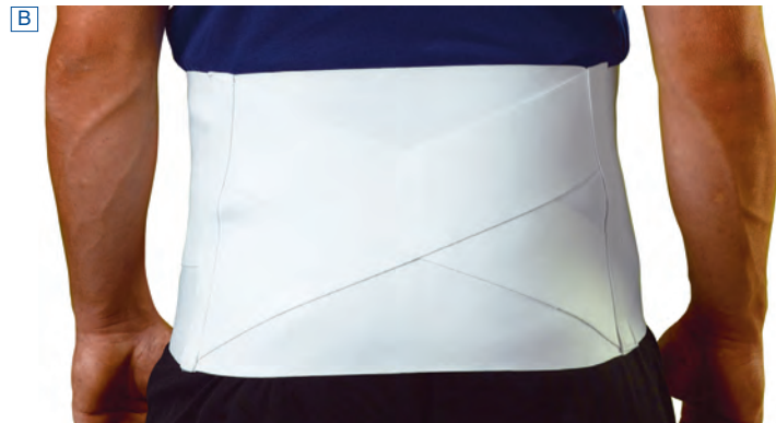
B Support strained lower back muscles with Medline's Criss-Cross Back Support