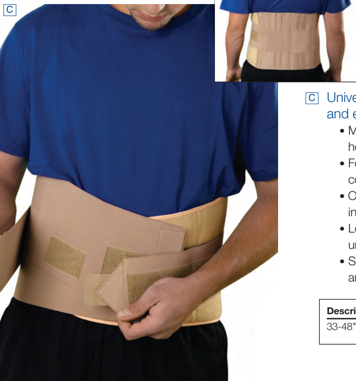
C Universal Back Support adjusts for a comfortable and easy fit