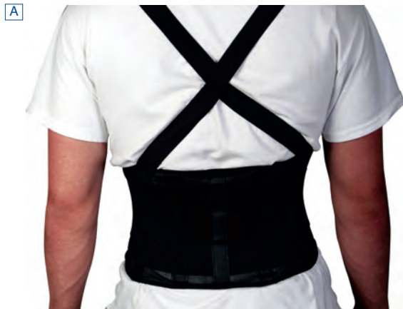
A Medline's Back Supports provide abdominal and lower back support to help prevent work-related injuries and encourage proper lifting technique